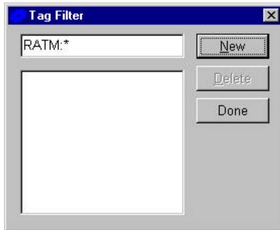
Figure 1: Tag Filter setup manager with RATM:* being typed in the New box.