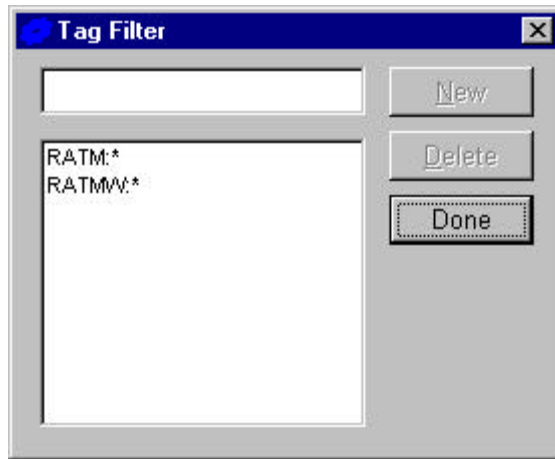
Figure 3: Tag Filter setup manager with the RATM:* and RATMW:* tags added

This tells RMTrak that the RATMW reports and views should only recognize tags if they begin with RATM: or RATMW: (and ignore all other tags).